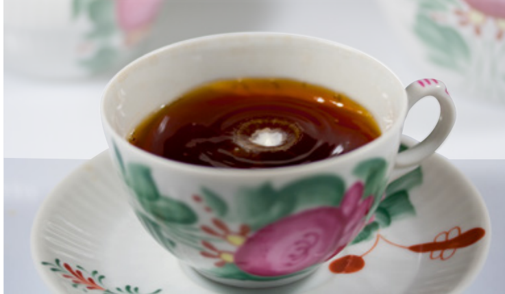
A cup of East Frisian tea with a traditional rose motif.

to the German Tea Association, East Frisia is the world's top consumer of tea with more than 300 litres consumed per person on an annual basis. Compare that to Europe's most famous tea drinkers, the British, who consume about 100 litres less! Average consumption for Germany (including East Frisia) is much lower at 28 litres.