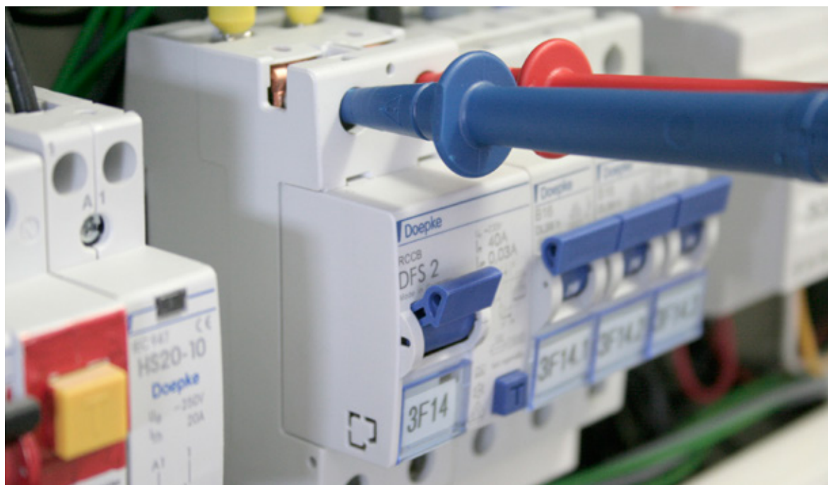
It is recommended that great care is taken when testing residual current circuit-breakers. Different factors need to be taken into account depending on the device type.