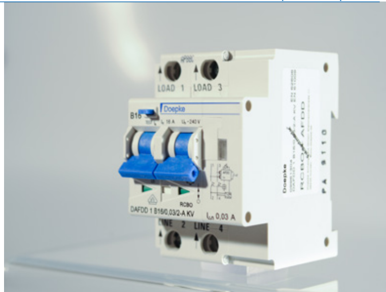
DAFDD 1 fire protection switch.

Easy to identify on the front of the device: viewing window for visual status messages